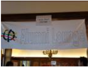
Alumni Lounge at the Food Festival

This year we had a really international gathering, with guests from the UK, Germany, USA, Norway and of course Switzerland. Approximately 120 alumni met in the former games room to have a chat about good old times and to meet up with former colleagues and teachers of SSTH.